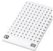
Marker card, Card, white, labeled, Horizontal: Consecutive numbers 1 - 10, 11 - 20, etc. up to 91 - (99)100, Mounting type: Adhesive, for terminal block width: 5 mm, Lettering field: 5 x 3.8 mm

Marker card - SK 5/3,8:FORTL.ZAHLEN - 0804183